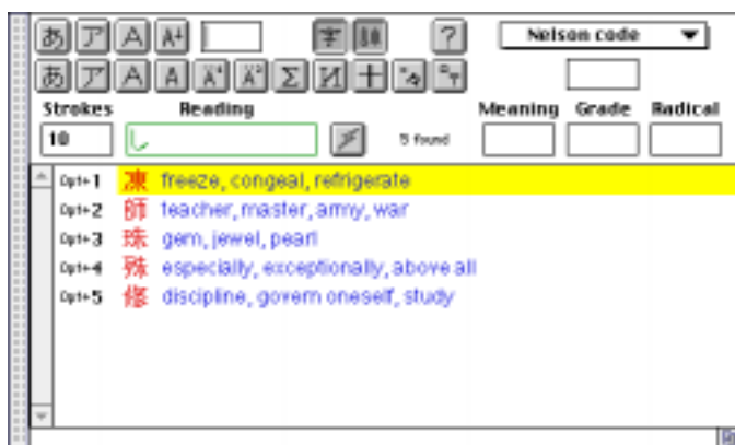
Input of Kanji using a combination of properties

This also means that no Japanese operating system software is required to run Japanese WordMage, simplifying installation and reducing costs significantly for budget-conscious students and schools.